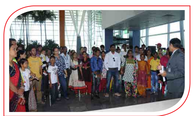
GVK KIA employees' family members at the newly inaugurated T1

GVK KIA, Bengaluru organised a walkthrough of the newly inaugurated Terminal 1A for the family members of employees. Walkthrough across this iconic marvel provide a great opportunity to showcase the new features of the Terminal including its enhanced facilities, passenger friendly design and world class infrastructure.