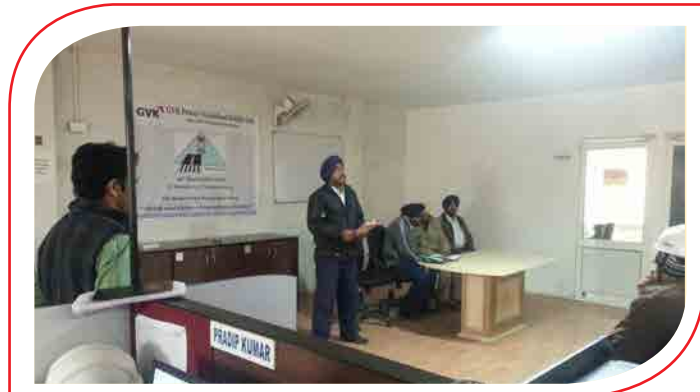
Goindwal Sahib TPP, Punjab