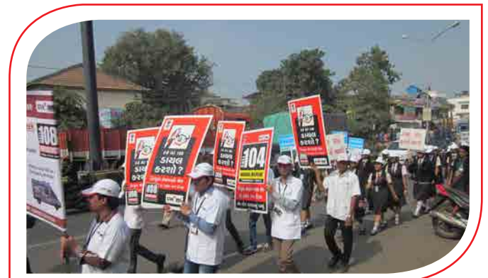
GVK EMRI-Dadra and Nagar Haveli