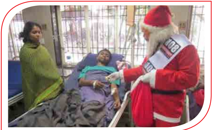
GVK EMRI-Dadra and Nagar Haveli