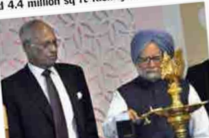
Prime Minister Manmohan Singh, along with Executive Chairman, Mumbai International Airport, G.V.K. Reddy, at the inauguration of Mumbai's T2 terminal on Friday.

"Very few airports in the world reflect the culture, ethos and the spirit of the country,"