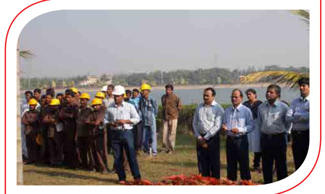
Gautami CCPP, Andhra Pradesh