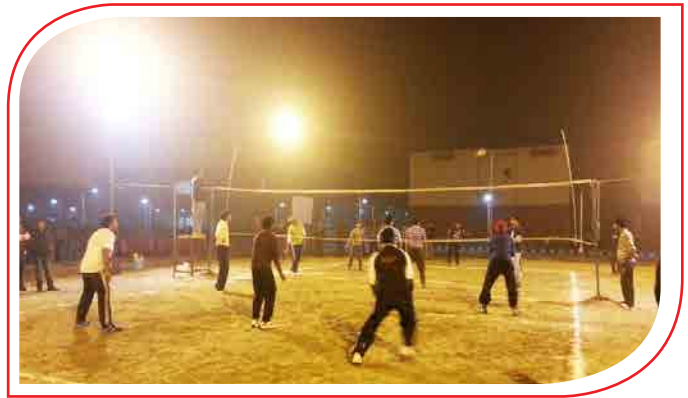
Participating employees at Volley Ball Tournament

The employees actively participated in the tournament making the event a grand success.