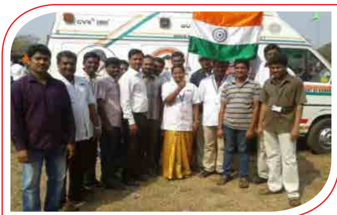
GVK EMRI-Andhra Pradesh