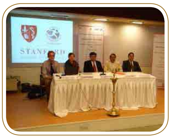
Dignitaries at the conference

GVK EMRI organised a seminar on 'Continuing Medical Education' in collaboration with Emergency Management Department Stanford University. The seminar conducted at Ahmedabad Management Association in Ahmedabad, Gujarat. The western concept of evidence-based medicine (EBM) was introduced, wherein medicines are given on a case-to-case basis ensuring right medicine and right intervention for the right patient. The seminar, by providing exposure to international practices, would aid emergency service providers to enhance the standards of response and management.