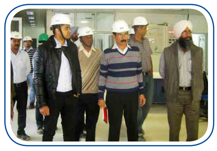
Visit to the Control Room