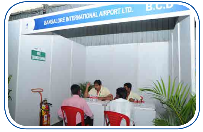
Job aspirants interacting with representatives