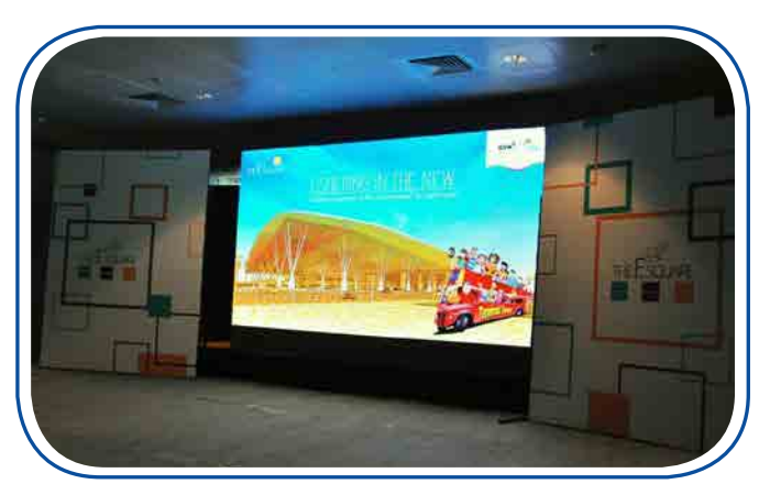
E-SQUARE event at GVK BIA