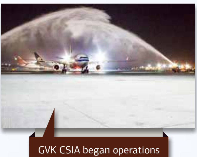
GVK CSIA began operations of Air China's direct flights between Mumbai and Beijing from T2