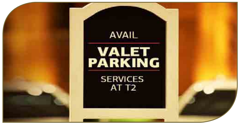
Valet Parking service at GVK CSIA T2

This service provides hassle free parking to its visitors and is being well received by the passengers.