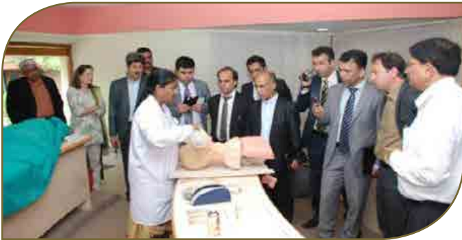
Afghanistan delegates at GVK EMRI

GVK EMRI Hyderabad Centre hosted delegates from NHS Leadership Academy, UK and Ministry of Health (MOPH) Government of Afghanistan & USAID Afghanistan. The delegates were shown the training facilities, ambulance demonstration etc. The visitors were impressed with the facility and appreciated the efforts of GVK EMRI team.