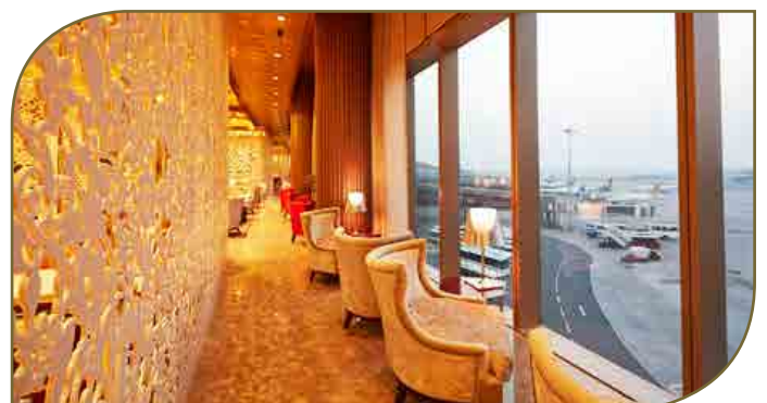
'GVK Lounge' at GVK CSIA T2