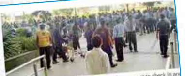
ON GUARD: As part of the drill, passengers who were yet to check in and waiting in the arrivals area were taken to the city side of the airport, and had checked in were shifted to the airside.

The operation began at 1.30 pm and ended at 3 pm. As part of the plan, a security alarm was raised when an unidentified bag was spotted in the zone 3M of the check-in area. Following the Bomb Detection and Disposal Solution team arrived within a few minutes. Evacuation of the entire T2 began at 2 pm. After thorough checking by the BDIS, the bag was declared safe within an hour and the drill was called off in 40 minutes. Around 20 police were stationed at the city side of the terminal area (level 4).