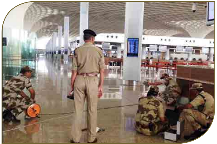
Evacuation Drill at GVK CSIA T2