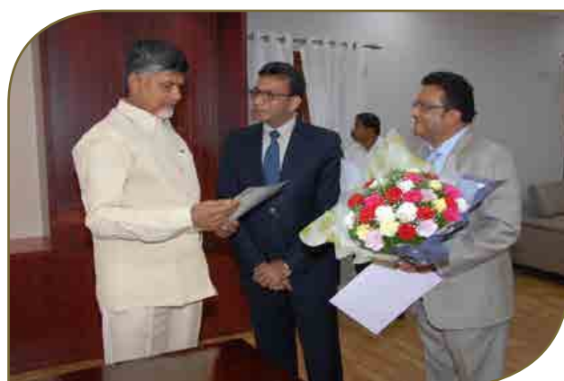
Mr Chandrababu Naidu, CM of Andhra Pradesh receiving the cheque from GVK BIO

GVK BIO contributed Rs. 20 Lakh to the Andhra Pradesh Chief Minister's Relief Fund for taking up relief measures in cyclone-hit Vishakhapatnam and its neighbouring districts. The GVK BIO employees donated their one day salary amounting to Rs. 10 lakh and an equal amount was donated by the company. The severe cyclonic storm 'Hudhud' was one of the two strongest tropical cyclones of 2014 within the North Indian Ocean, as well as the most destructive tropical cyclone in the basin since Nargis in 2008.