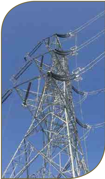
Transmission line connected to the power grid