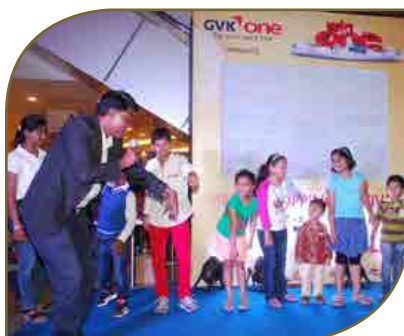
Children's day celebrations at the finale event