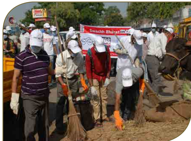
GVK EMRI's staff contributing towards the 'Swachh Bharat' Campaign