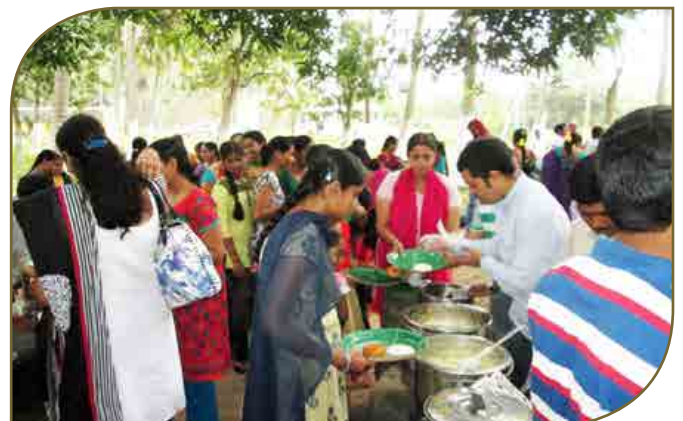
Vanabhojanam celebrations at Jegurupadu CAPP