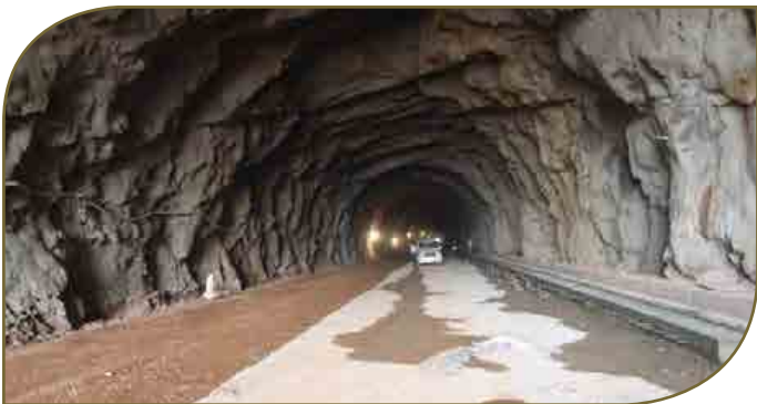
Through view of the tunnel

The construction of water tanks for the fire safety of the tunnel as well as Emergency Egress and Portals has been completed at the site. The tunnel is now through with construction of pavement works. These developments take the project closer to commissioning.