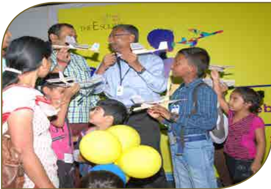
Children's Day celebrations at GVK KIA, Bengaluru

GVK KIA employees together with their Children indulged in fun activities to commemorate Children's Day through an Aero Modeling exercise.