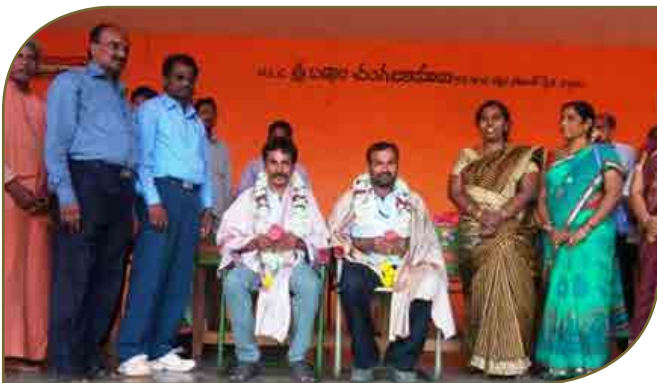
GVK EMRI associates felicitated at Chitvel High School in Andhra Pradesh