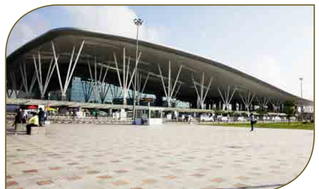
GVK KIA, Bengaluru

It shows BIAL's commitment towards environmental sustainability. The e-freight concept was launched by IATA in 2006 as part of the simplification of the business program.