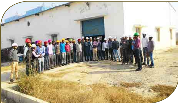
Tool Box Talk Session at Goindwal Sahib TPP

Goindwal Sahib TPP has begun Tool Box Talk pertaining to safety awareness for its employees. Tool Box Talk is an informal group discussion conducted every morning focussing on a particular safety issue. Such tools would help promote safety culture among employees at the project site.