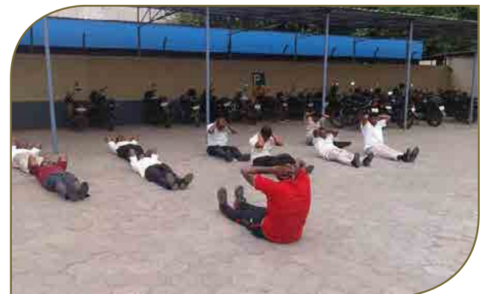
Fitness sessions at Taj Clubhouse