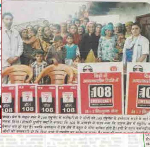
जागरूकता अभियान में 108 एबुलेस के उपयोग के बारे में लोगों को जागरूक किया। शू 108 के उपयोग के बारे में जागरूकता अभियान में 108 एबुलेस के उपयोग के बारे में जागरूक किया।