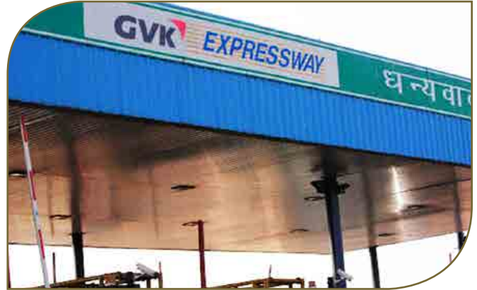
Toll Plaza at Jaipur-Kishangarh Expressway Project