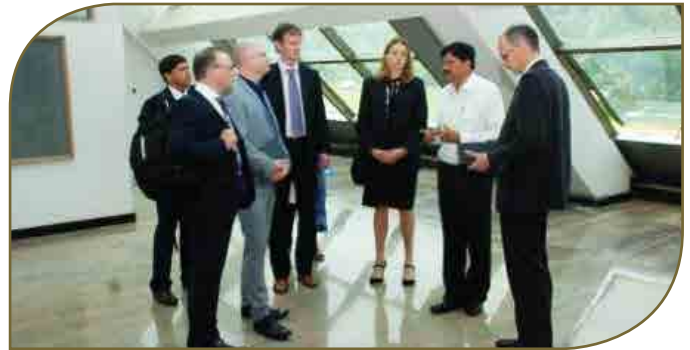
NHS,UK delegates at GVK EMRI