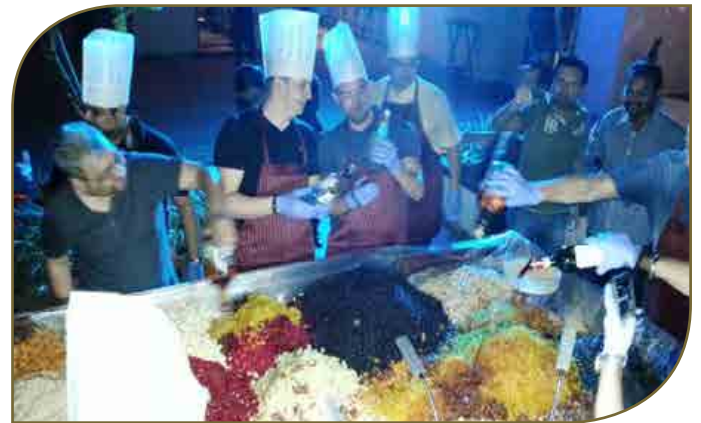
Cake Mixing ceremony at Taj Clubhouse