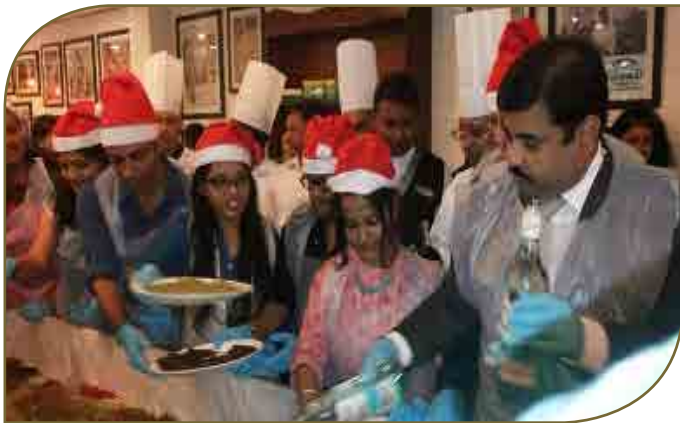
Cake Mixing ceremony at Taj Banjara

Taj Banjara and Taj Clubhouse carried this beautiful tradition forward and began the cake preparation with the mixing of ingredients and soaking them. Regular guests and important socialites of the city were invited for this event. Everyone enjoyed this tradition as it was a novel way to ring in the festive season. The ambience was lit up with lot of cheer from the guests with loads of mixing and clicking of selfies.