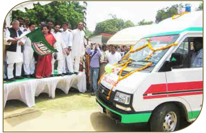
GVK EMRI (102) ambulance launch in Allahabad, UP