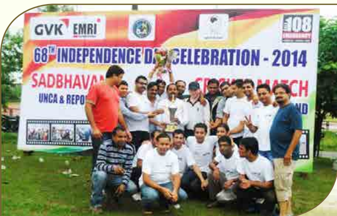
Participating cricket teams