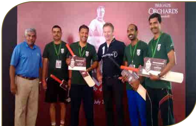
The winning team with Steve Waugh