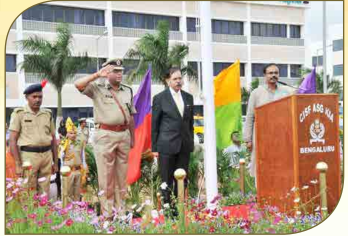
Flag hoisting ceremony at GVK KIA