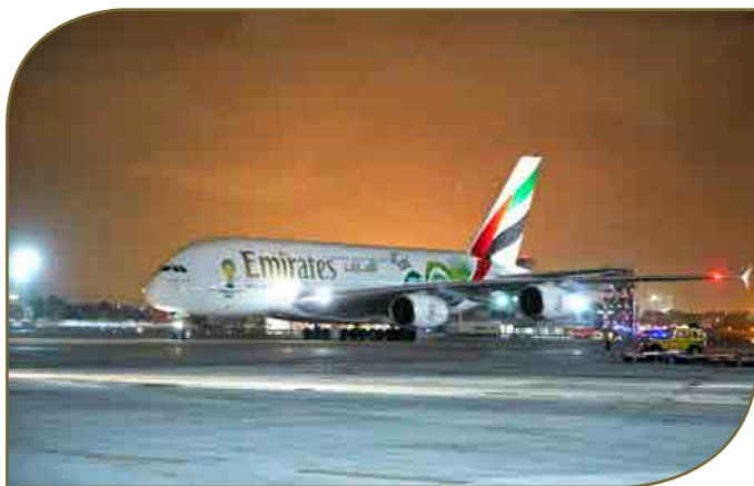
First Emirates Airbus A380 flight lands at GVK CSIA, T2

GVK CSIA, Mumbai crossed yet another milestone when Emirates flight EK-500 arrived at T2, Mumbai for the first time. The Gulf carrier Emirates became the second airline to operate jumbo A380 aircraft in India after Singapore Airlines, with the commencement of its first daily flight to Mumbai from Dubai.