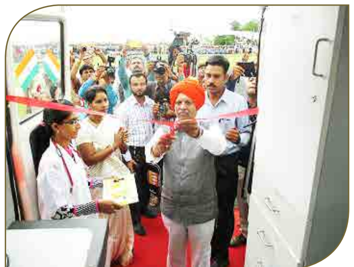
Ambulance being launched at MHU (Arogya Sanjivani)