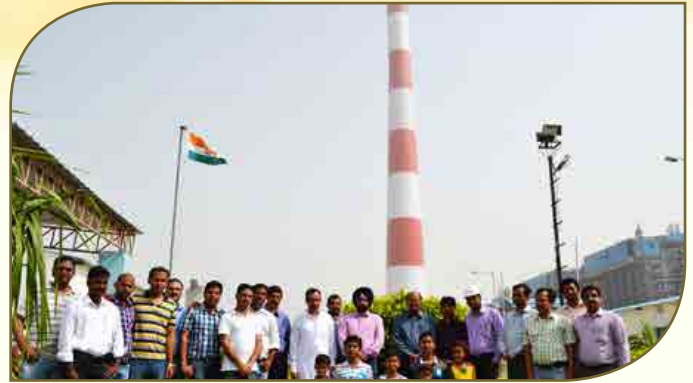
Employees and their families enjoying the celebrations