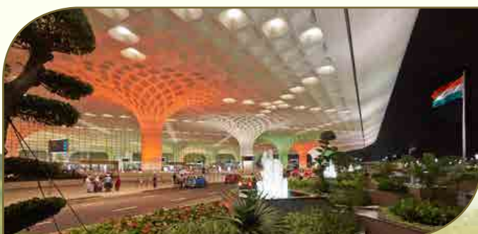
Light decoration at GVK CSIA T2

GVK CSIA, Mumbai celebrated Independence Day with many fun-filled activities. To mark this special occasion, T2 was illuminated in Saffron, White and Green colours resembling the Indian flag. While, the domestic terminal T1 was draped in tricolour to give the passengers a feel of the Independence Day celebrations. The day began with flag hoisting ceremony at T2 lead by CISF followed by showcasing of their skills and discipline activities which attracted the attention of a lot of guests and passengers present at the occasion. One of the key highlights of the Independence Day celebrations at CSIA was the super charged and entertaining flash mob by a group of 20 students from Jai Hind College, Mumbai.