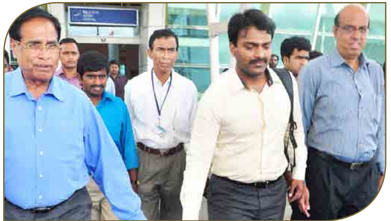
The team of doctors coming out of Coimbatore International airport with the harvested liver

Adding to the remarkable feat of emergency services, GVK EMRI's efficient and speedy response mechanism set new standards when a 108 ambulance in Chennai helped save a person's life by successfully transporting a harvested liver of an accident victim from the Rajiv Gandhi Government General Hospital (RGGGH) to the Chennai airport. The harvested liver was then airlifted to the Coimbatore hospital where a team of surgeons successfully transplanted the harvested liver on a patient.