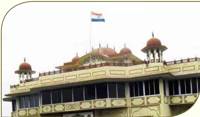
Flag hoisting ceremony at Jaipur - Kishangarh Expressway Project

Jaipur-Kishangarh Expressway Project celebrated the Independence Day. The flag was hoisted at the KSG Plaza followed by parade by the security staff.