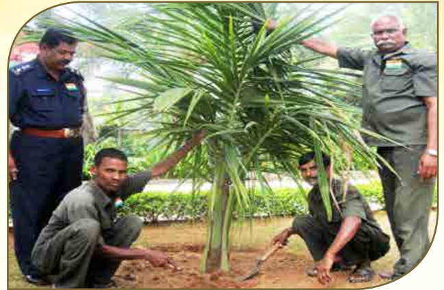
Tree plantation by staff