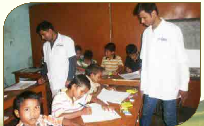
Drawing Competition for orphans