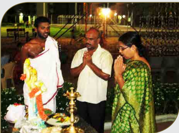
Puja ceremony at Jegurupadu CCPP