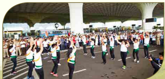
Flash Mob performance at GVK CSIA T2