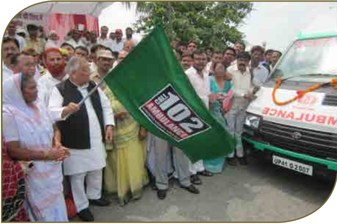
GVK EMRI (102) ambulance launch in Gorakhpur, UP