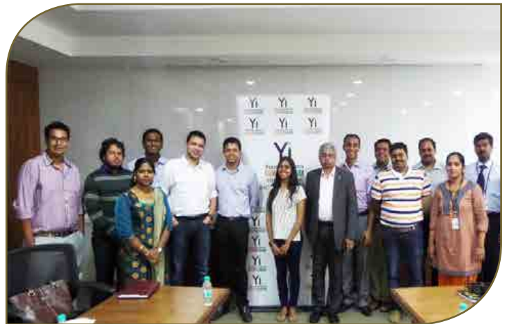
CII-Yi group members on their visit to GVK KIA

The prestigious CII – Yi (Young Indians) group members were invited to visit GVK KIA, Bengaluru to understand the behind the scenes of an airport. They were introduced to the overall airport functioning and were also given a tour on the airport processes and what goes behind the scenes. From check-in, the tour continued to the airside and the team had an opportunity to know more about the important passenger and aircraft handling procedures, baggage services.