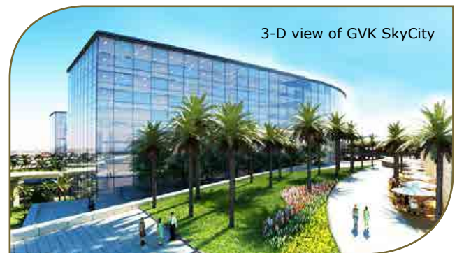
3-D view of GVK SkyCity

GVK MIAL crossed a major milestone when it awarded the first land parcel to Oasis Realty Private Limited for commercial development of GVK SkyCity for Rs 580 crore. This parcel will have a potential for commercial development of 1.166 million square feet. This is part of the process of overall commercial development of 22 million square feet in phases over a period of 10 years.