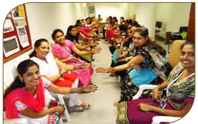
Participants at the Mehendi competition

GVK CSIA Mumbai Security Team organized a ‘Mehendi competition’ for all women employees. The event saw good participation from women employees who were given an hour to complete the mehendi design. The event brought to the fore the artistic talent among women employees.