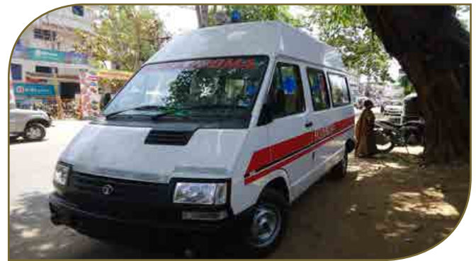
Dedicated ambulance service at Tokisud Project

GVK has dedicated ambulances towards the service of the people of R&R colony at Tokisud project site in Jharkhand. These ambulances will cater to the 68 PAFs (Project Affected Families) and residents of the neighbouring villages of Urej and Deoghar.