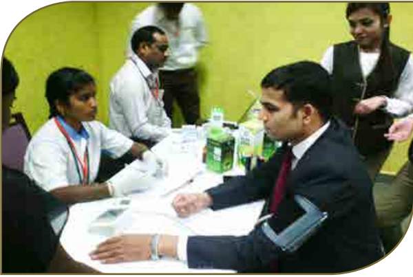
Health check camp at Vivanta by TAJ

Vivanta by TAJ, Begumpet organised an exclusive 'Free' Health Check Camp for associates in collaboration with the prestigious Apollo Health Care group in Hyderabad. The associates got themselves checked for Diabetes, Blood pressure, Dental care etc. Prior to the camp, a poster campaign was also organised to create awareness and ensure maximum participation from the associates as it is important for every person to get themselves checked on regular basis.