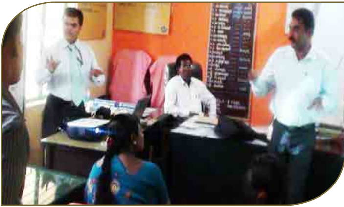
Environment awareness session

GVK KIA, Bengaluru Safety, WLC and Land side traffic team conducted a session on 'Environment awareness and Bird activity impact on aircraft movement'. The Panchayat Development Officer, Panchayat Secretary, Panchayat members and residents from the neighbouring areas participated in the session. This is the fourth session conducted by the safety team.