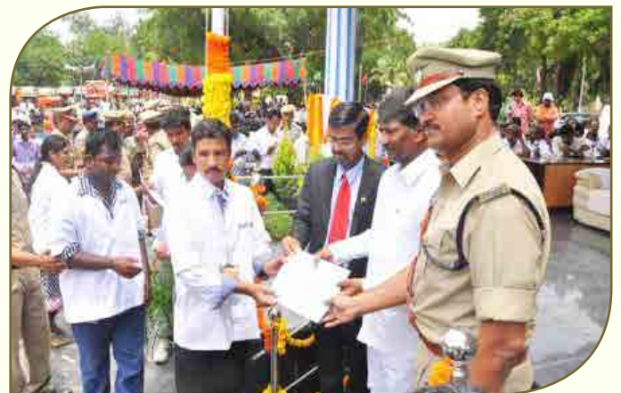
Associates being felicitated by State and District Govt authorities