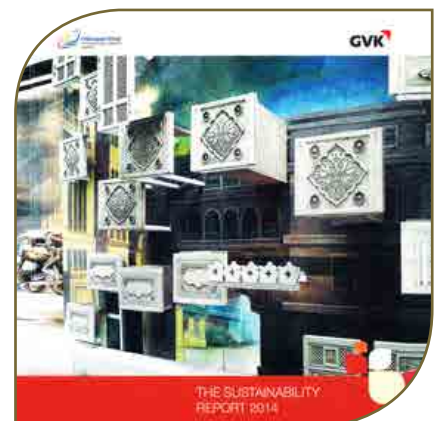
GVK CSIA Sustainability Report

GVK Mumbai International Airport Limited (MIAL) has released its second annual Sustainability Report – “The Sustainability Report 2014” that highlights the achievements of GVK MIAL. This is a significant development by GVK MIAL building upon its commitment to sustainability. This report follows the latest GRI G4 reporting guidelines and meets in accordance ‘Comprehensive’, the highest application level for completeness, transparency and stakeholder inclusiveness. GVK CSIA is the 1st Airport in Asia and the 5th in the world to release a report as per the G4 guidelines. Kudos to GVK MIAL sustainability team.