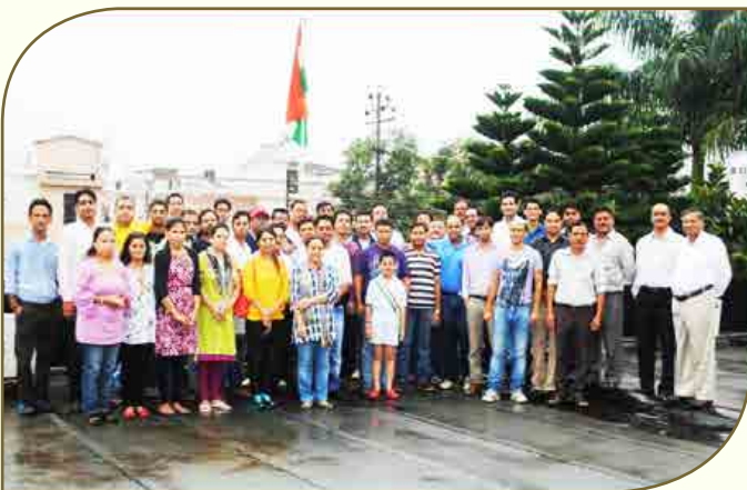
Independence Day celebrations at GVK EMRI

A range of other activities like cultural performances, drawing competition for orphans, friendly cricket match were also part of celebrations across locations.