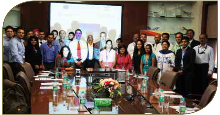
Participants and guests at Environmental Management Workshop

GVK CSIA organized an Environmental Management Workshop – Airport Carbon Accreditation in collaboration with DGCA. The workshop touched upon the prevailing environmental conditions in the country and sector specific performances of Indian Aviation Sector. It also marked the commencement of Airport Carbon Accreditation Level 3 “Optimization” project at MIAL. Senior environmentalists from European Union presented the subject with members from MIAL departments and other stakeholders like Airlines, Ground Handlers and Bangalore International Airport Limited (BIAL).