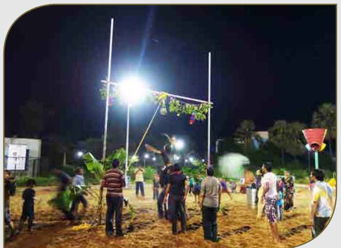
Dahi Handi ceremony at Gautami CCPP