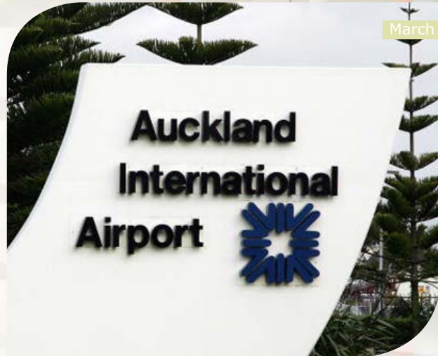
GVK MIAL signed a Memorandum of Understanding (MoU) with Auckland Airport, forming a 'sister airport' relationship that would help increase international air links and tourism between and beyond both airports' respective countries.