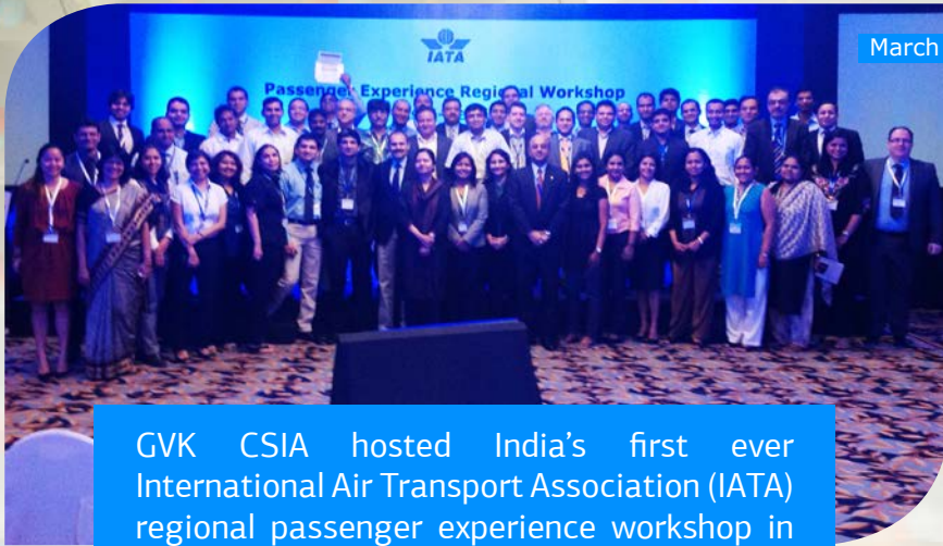
GVK CSIA hosted India's first ever International Air Transport Association (IATA) regional passenger experience workshop in Mumbai that focussed on the methods and technologies to make the passenger travel smooth and hassle free.