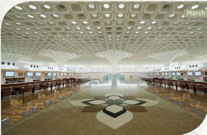
GVK CSIA, Mumbai received the DNV Business Assurance Management System Certificate for its conformation to the Management System Standards.