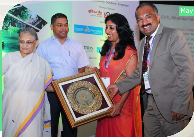
GVK CSIA was bestowed with the 'Golden Peacock Innovative Product/Service Award' for its Pranaam GVK Guest Services. This is a special initiative to provide guests with seamless and stress-free experience while travelling through CSIA, Mumbai.